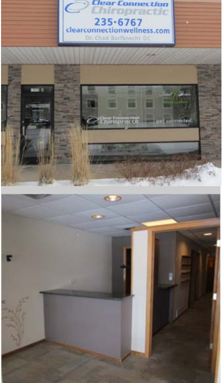
Visit our web site at

The Ellefson Group, LLC 424 Oak Ave. Menomonie, WI 54751 888-683-8001 www.ellefsongroup.com